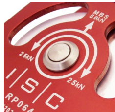
Bushings Ideal for high loads at low speed